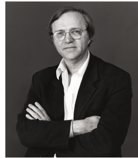
Robert Storr.

The distinguished contributors to the publication accompanying the exhibition will discuss further some of the ideas presented in their essays including the performative aspect of her constructed tableaux; expressions of black beauty; and Weems's place within a broader tradition of pictures of African Americans by African Americans.